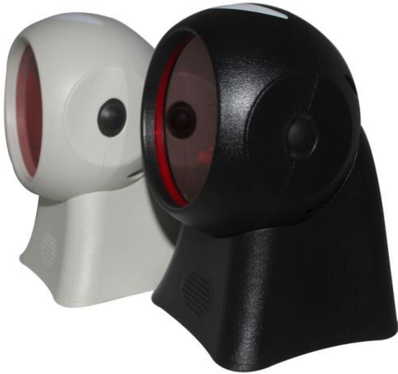
Model: RK8120 Omnidirectional Barcode Scanner